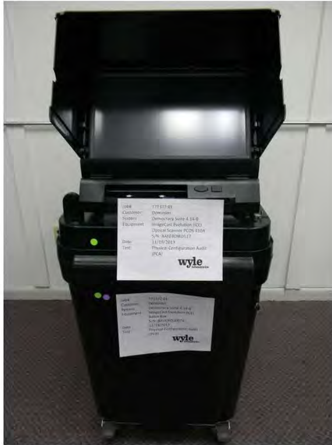
Photograph 1: ImageCast Evolution (ICE) on Plastic Ballot Box

(The remainder of this page intentionally left blank)