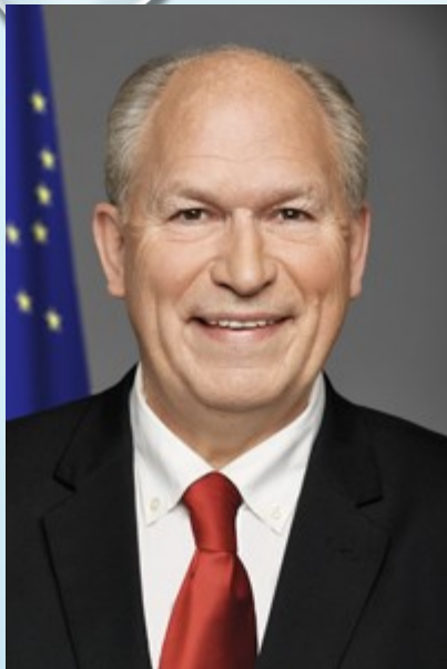
Bill Walker, Governor