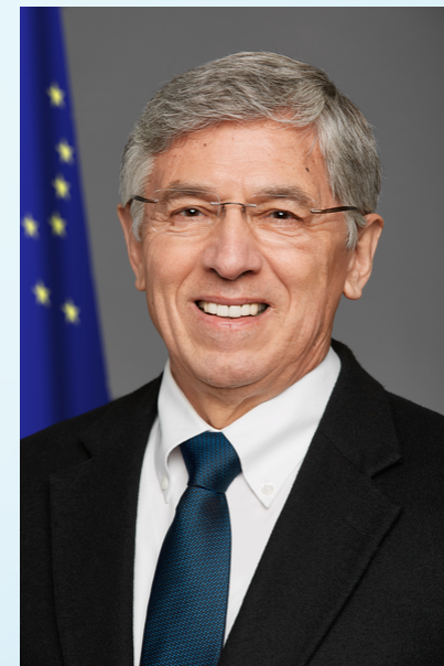
Byron Mallott, Lt. Governor