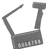
Red – Ballot Scanner