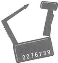
Red – Touchscreen