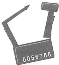
Red – Voter Card Activator