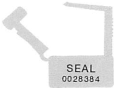
Yellow – Touchscreen

THIS FORM, ALONG WITH THE BROKEN/USED SEAL BAG MUST BE RETURNED TO THE RECEIVING STATION IN THE BLACK RETURN BAG.